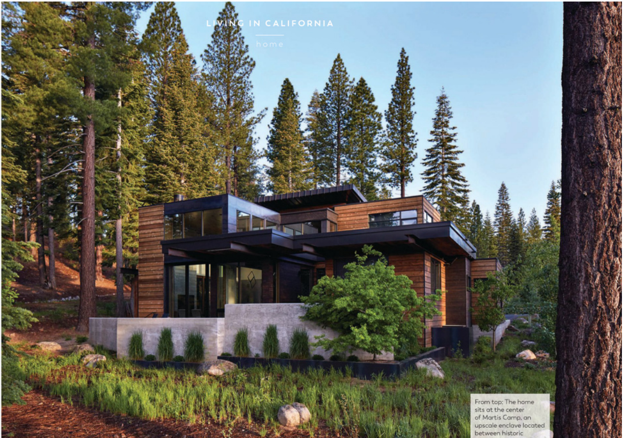
From top: The home sits at the center of Martis Camp, an upscale enclave located between historic Truckee and North Lake Tahoe; elegant custom built-in cabinetry keeps the entry clear of clutter while giving the owner's art collection its due.