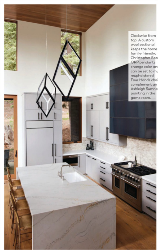
Clockwise from top: A custom wool sectional keeps the home family-friendly; Christopher Boots ORP pendants change color and can be set to music; reupholstered Four Hands chairs complement an Ashleigh Summer painting in the game room.