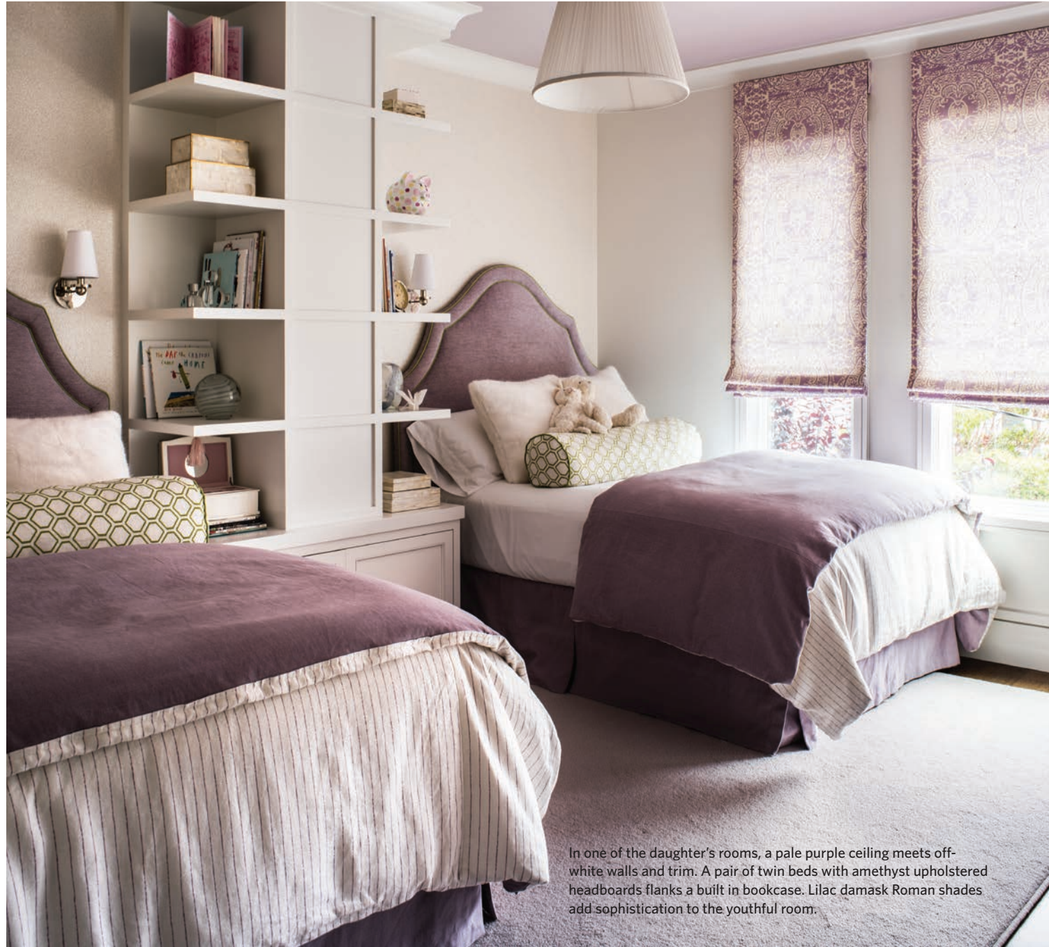
In one of the daughter's rooms, a pale purple ceiling meets off-white walls and trim. A pair of twin beds with amethyst upholstered headboards flanks a built-in bookcase. Lilac damask Roman shades add sophistication to the youthful room.

The design team reconfigured the building's early twentieth century floor plan of separate dining and kitchen areas to an open multi use space. An inviting eating nook replaces formality with a built-in banquette and white Tulip Saarinen Dining Table. Transparent acrylic side chairs add additional seating. Triggs juxtaposed the pewter shell with Polish artist Andrzej Karwacki's brilliant hued triptych. A light fixture composed of borosilicate glass rods illuminates the corner. For impromptu dining, family and friends perch on upholstered brushed nickel counter stools at the Kitchen Island or lounge in the adjoining media room.