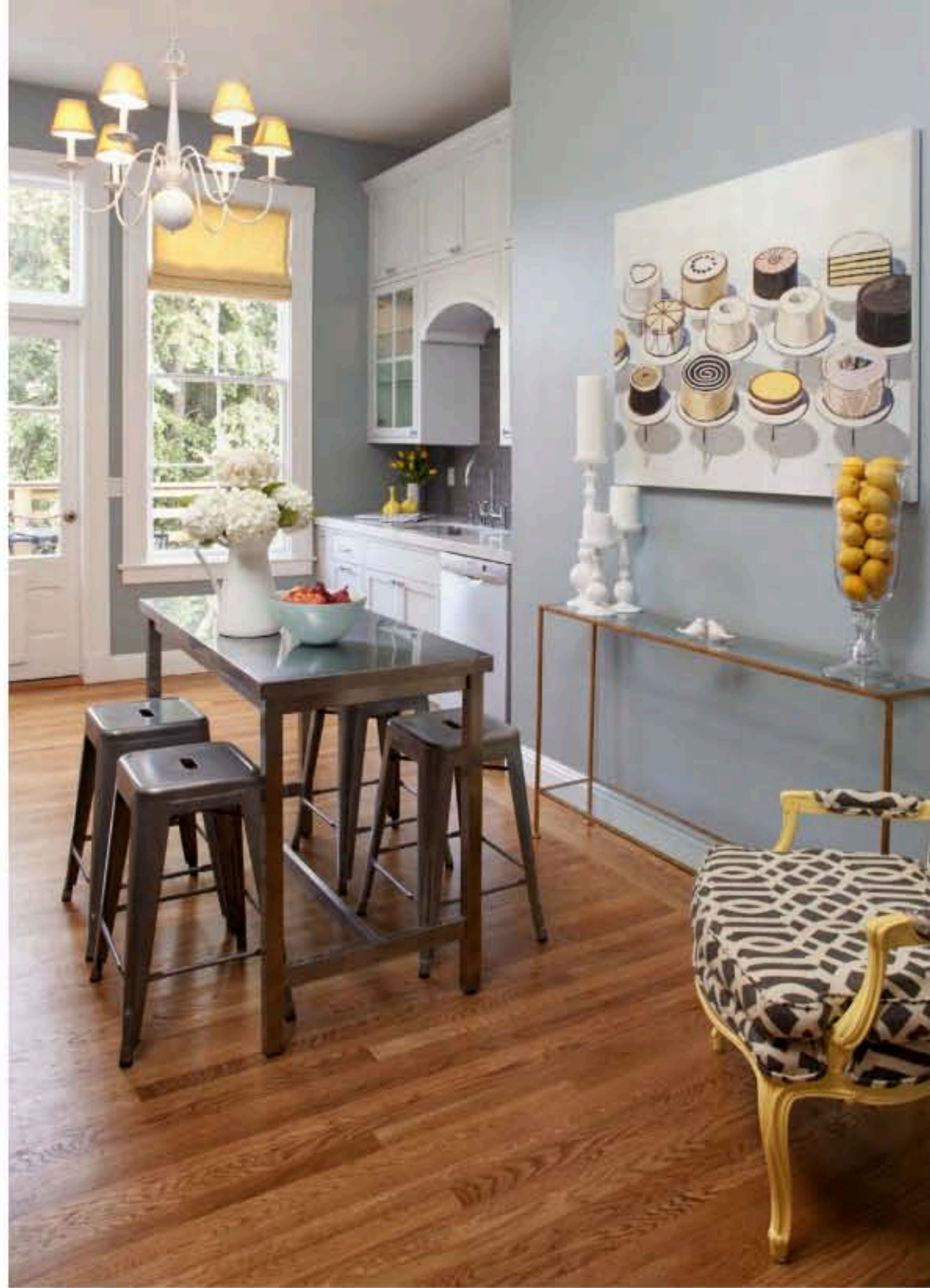
Bringing the Outdoors In: Greenery seen through the expanded windows is a luxury in condo living, reflecting happy color into the kitchen.